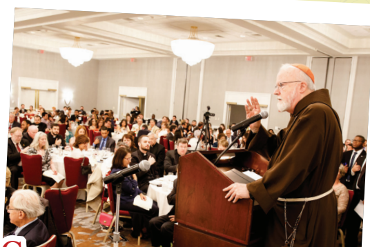
CARDINAL SEÁN ADDRESSES GALA DINNER GUESTS

Excerpt from keynote speaker George Weigel