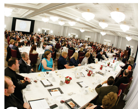
GUESTS LISTENING TO KEYNOTE SPEAKER GEORGE WEIGEL