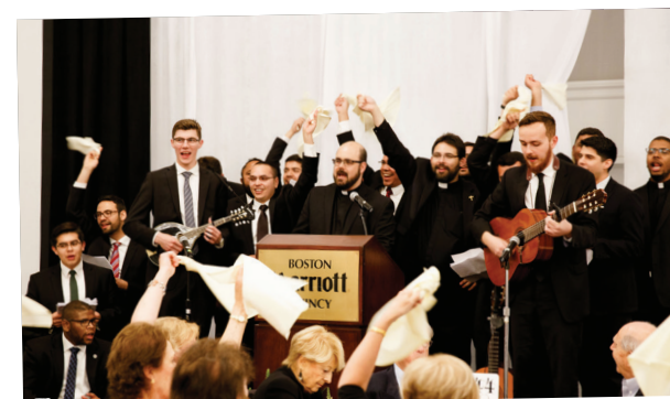
SEMINARIANS DEDICATE A SONG TO CARDINAL SEÁN AND GALA DINNER HONOREES